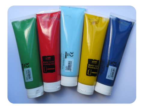
coloured printing inks