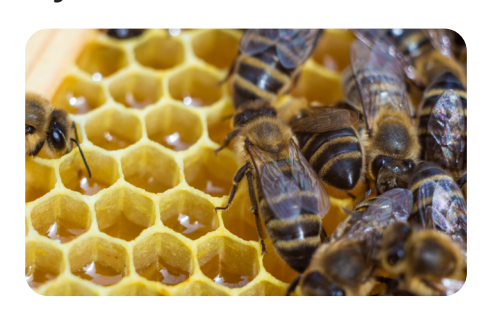
honey from bees