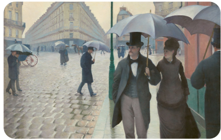
Paris Street; Rainy Day by Gustave Caillebotte, 1890